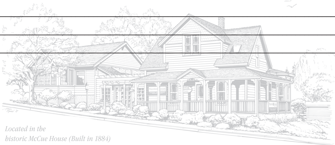
Located in the historic McCue House (Built in 1884)

Other information which would assist us in evaluating your claim: _____